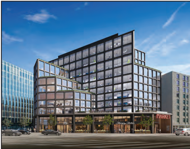
Morris Adjmi, architect, M Street Perspective, 2100 M Street.

Plans for a major renovation and expansion of the building at 2100 M Street NW will have a hearing before the Board of Zoning Adjustment on October 7.