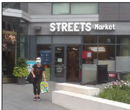
Food shopping at 1225 22nd Street NW.

A modern restaurant dedicated to Thai market foods. The owners were from Bangkok, Thailand, where Soi 38 is a night market. Accepts reservations. 2101 L Street. 202-558-9215.