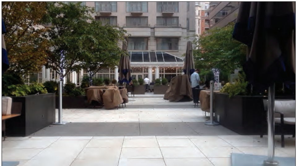
The Fairmont Hotel courtyard is adjacent to the lobby bar, and newly re-opened in Phase Two garb.

We’d like to see this venerable West End institution find its groove again. The $23 burger on the ample and interesting bar