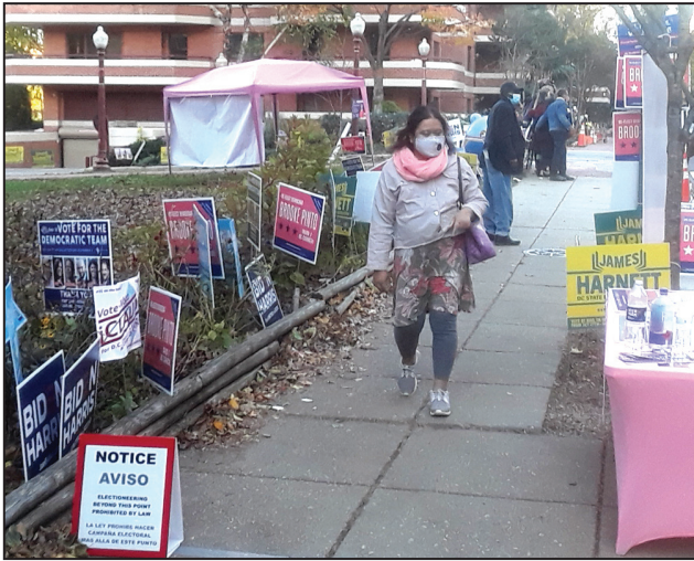
Voters encountered few lines at Precinct 4 on Election Day, November 3, 2020.

While all 3,655 registered voters in our precinct were mailed ballots this year according to the Board of Elections, the turnout was 56.6%. That is less than in