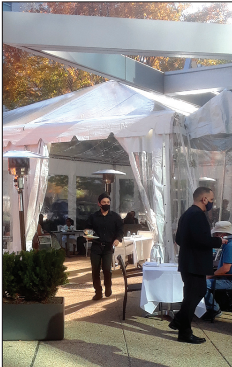
Making the best of autumn at Rasika West End.

Now has outdoor heaters, more sidewalk tables. The menu satisfies burger eaters, vegetarians, flatbread lovers; has full dinner options, kids' food, pasta, and desserts. 2201 M Street NW. (202) 524-7815.