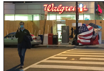
Walgreens behind election plywood, November 2.

In the West End, the Exxon station on M Street, both drug stores, and other office buildings had boarded up by election day.