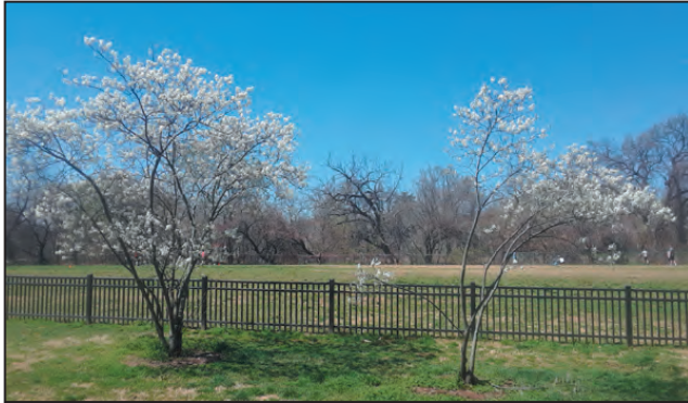
Spring on Francis Field, March 30, 2021.