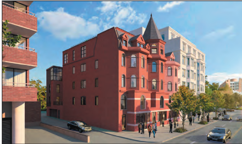
of 2519 and 2525 Pennsylvania Avenue project.

The townhouse furthest east, at 2517 Pennsylvania Avenue, is not part of the project, but is in a better state of restoration than the two under contract